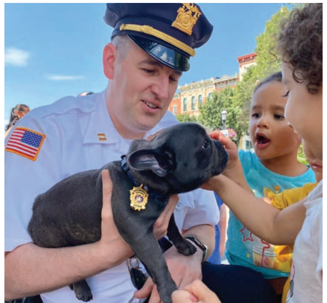
Rosie the French Bulldog

A few weeks ago, our little ones had a delightful surprise during a community meet and greet with Rosie, the Ossining Police Department's very own K9 Goodwill Ambassador! Rosie brought joy and laughter as she wagged her way into the hearts of our children. The kids couldn't stop smiling as they petted and played with their new furry friend. A huge thank you to the Ossining Police Department for making this special visit possible. Your support and dedication to our community mean the world to us!