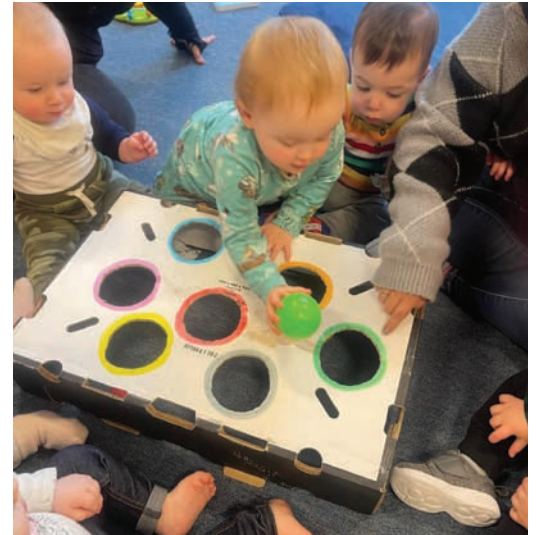
Our infant teachers created a homemade game for our babies to match the colors and fit the balls into the circles. The activity introduced the infants to object permanence as the balls disappeared into the box only to reappear seconds later. In addition, the activity helped to develop the children’s hand-eye coordination and gross motor skills as they reached across the box to the appropriate hole.

We are incredibly proud of our alumni and grateful to the Ossining High School Research Program for providing them with opportunities to excel. Together, we are building a community that values and nurtures the inquisitive minds of our children, ensuring they have the tools to achieve great things.