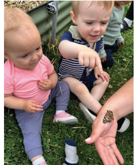
Butterfly Magic: Our infants were overjoyed to release butterflies they nurtured from caterpillars in their classroom!

While the big kids were out and about, our tiniest tots embarked on their own delightful adventures.