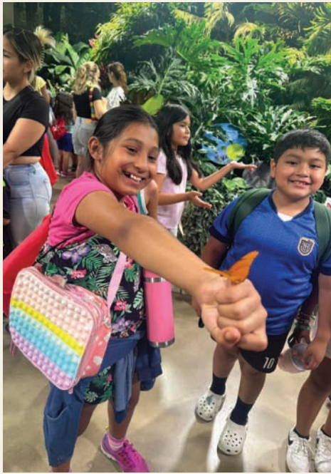
Museum of Natural History