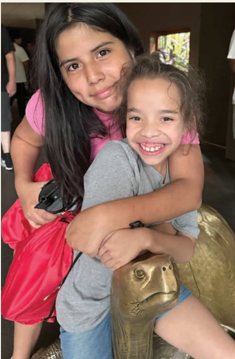
Central Park Zoo

Our children had an amazing time discovering the wonders of the animal kingdom.