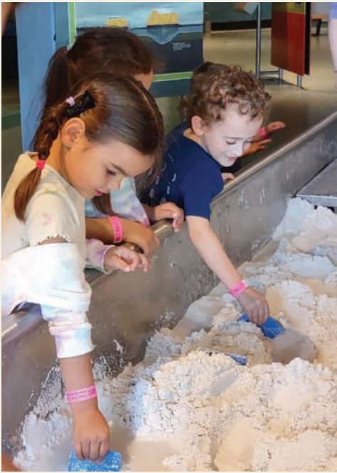
Liberty Science Center

Our budding scientists were thrilled to explore the Natural History Museum and the Liberty Science Center, sparking their curiosity and a love for discovery.