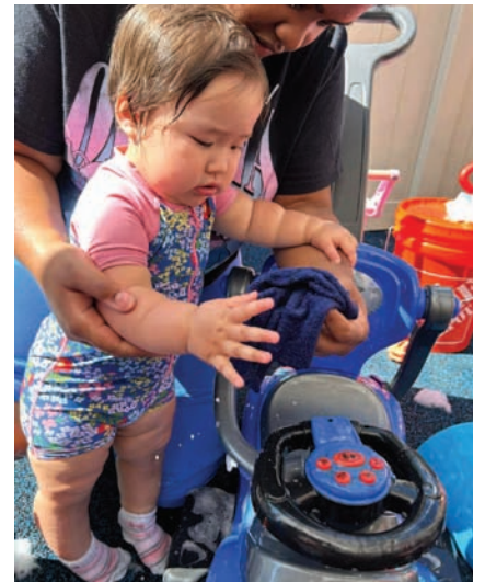
Tiny Tots' Car Wash: Our little ones had a blast soaping up and scrubbing down their ride-on cars!