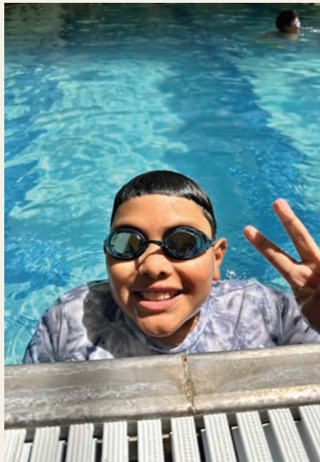
Ossining Aquatic Center

Our children enjoyed refreshing days at the Ossining Aquatic Center and Stillwater Lake. A huge thank you to our community partners at the Ossining Recreation Department and to the Stillwater Lake Community Association for providing these wonderful experiences.