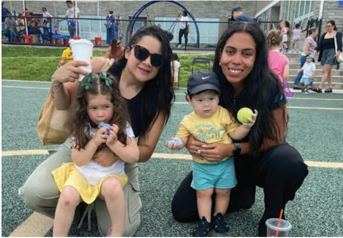
Moms and Dads enjoyed the opportunity to spend time with other parents, a luxury they don't have during the rushed drop-off and pick-up times during the week.

Greetings from the OCC parent committee! Ossining Children's Center has been a "home away from home" for our kids and we love the sense of community it has provided them. As a group, we wanted to take it a step further to provide opportunities for all OCC families to connect meaningfully through various events and activities throughout the year – it can be hard making new friends as a parent! In May 2024, we had a great turnout with our "Playdate on the Playground" event, where parents chatted with one another while the kids played outside, and families had their professional photos taken for free. We look forward to another fun-filled year of bringing families together!